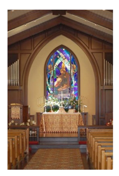
April 2011 Volume 15, Issue 4