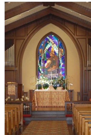
August 2011 Volume 15, Issue 7