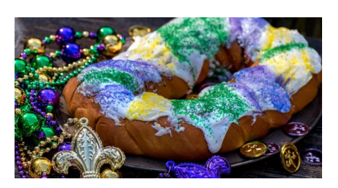
SHROVE TUESDAY PANCAKE SUPPER! FEBRUARY 25, 2020 5:30 PM

The Church Staff will be providing breakfast!