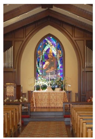
February 2020 Volume 24, Issue 2