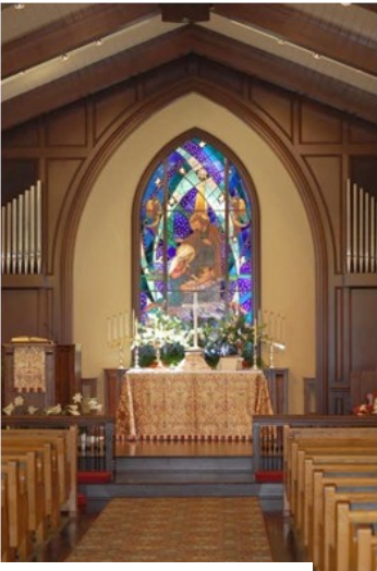
January/February 2014 Volume 18, Issue 1