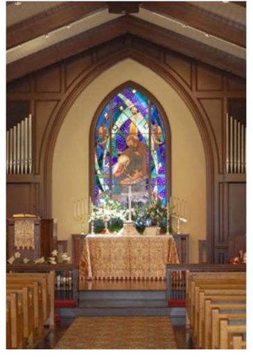
November 2015 Volume 19, Issue 9