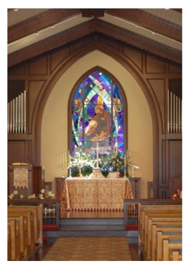
October 2016 Volume 20, Issue 8