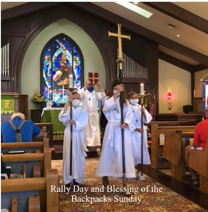
Rally Day and Blessing of the Backpacks Sunday