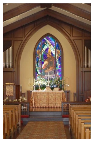
November 2021 Volume 25, Issue 11