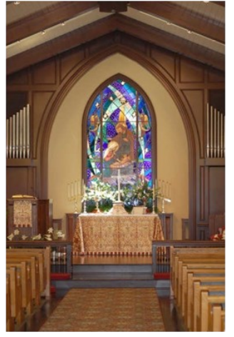
March 2022 Volume 26, Issue 2