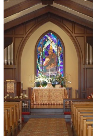
May 2022 Volume 26, Issue 4