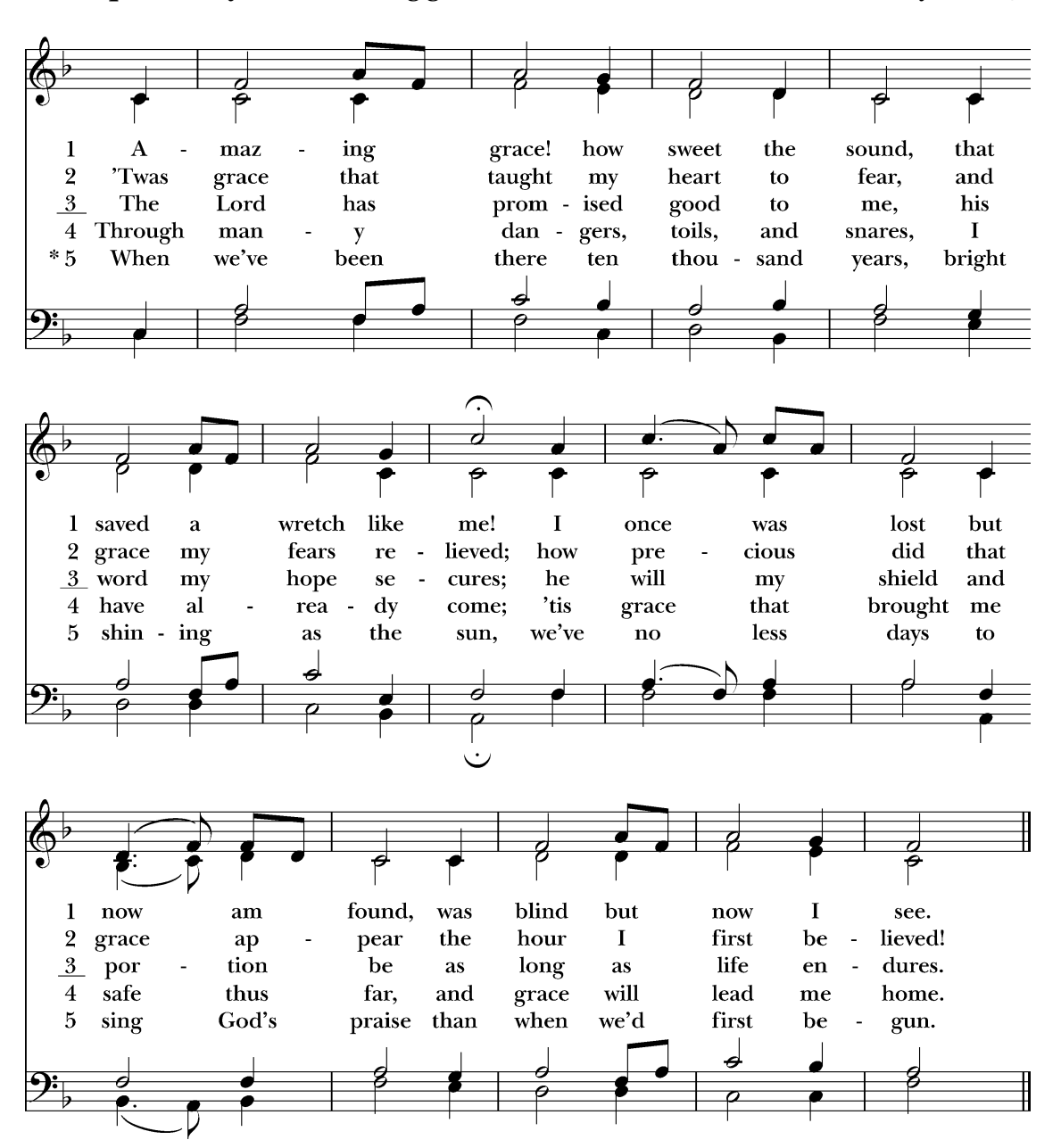
The melody may be sung in canon at distances of either two or three beats.